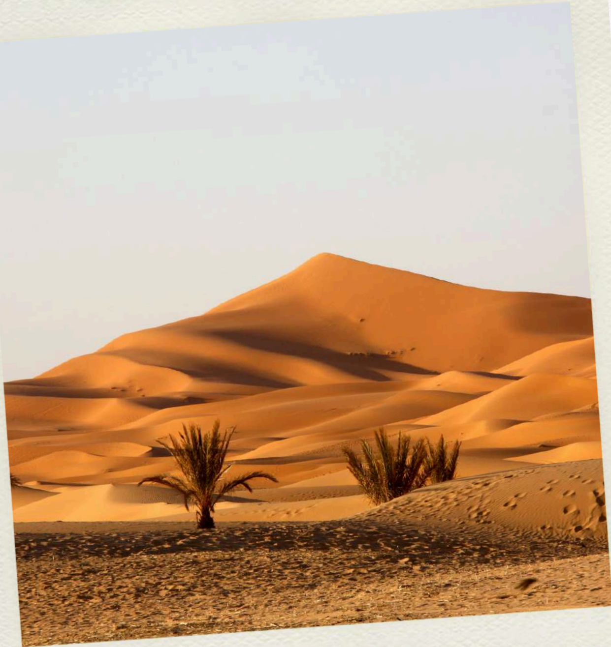
The Sahara Desert